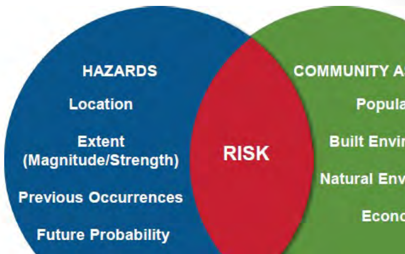
From FEMA G-318, Local Hazard Mitigation Planning Workshop Presentation